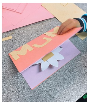
How to be creative and make pop-up cards