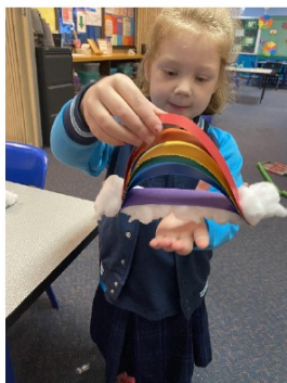
The amazing rainbow creations